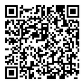
PREK/K CLASS WISHLIST

CATERPILLAR, BUTTERFLY & BUSY BEE WISHLIST